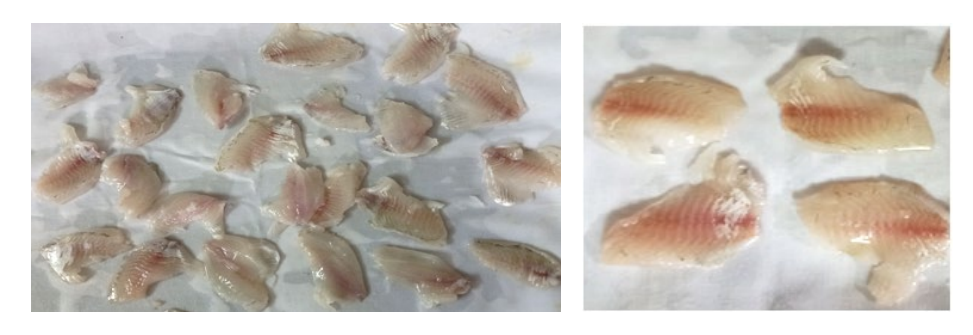
Fig. 2. Fish meat samples for chemical composition analysis.

The average temperature of the treatments was in the range of 27.0 °C – 27.8 °C; pH 7.7–8.0; DO 5.5–5.7 mg/L; salinity 15.3; TAN 0.38–0.48 mg/L; N-NO<sub>3</sub><sup>-</sup> 0.36–0.39 mg/L (Table 3). Daily water quality parameters such as temperature, pH, DO, and salinity during the experiment did not vary significantly among different treatments (p > 0.05). However, water quality in relation to nutrition (nitrogen and phosphorus) increased gradually