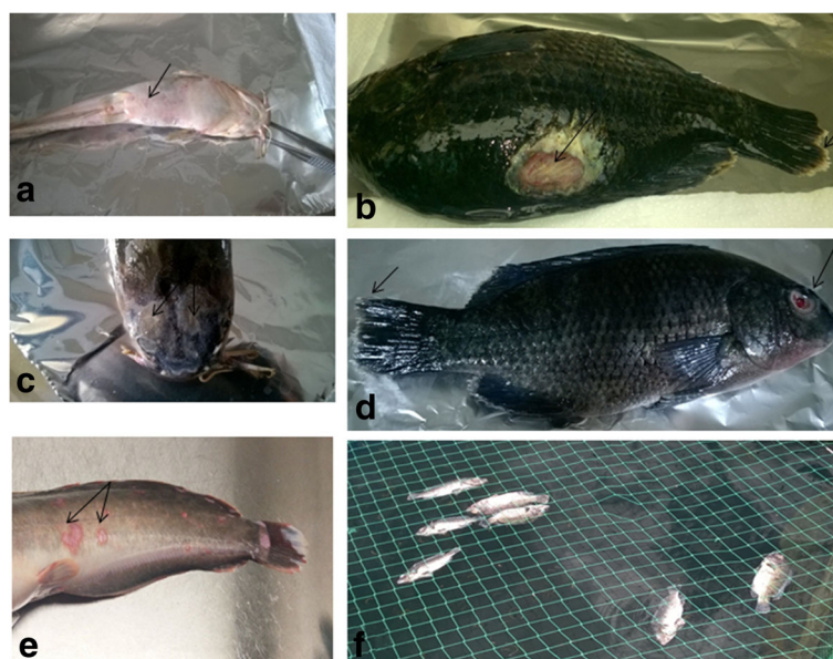
Fig. 2 Disease signs and symptoms observed in fish during sampling. Arrow heads show; (a) hemorrhages in catfish; (b) skin ulcer and fin rot in Tilapia; (c) discoloration of the back skin in catfish; (d) collapsed eye and fin rot in tilapia; (e) skin ulcers in catfish; (f) dead fish in a tilapia cage

A total of 15 genera, with at least 18 different species of bacteria were identified. Of particular interest, the following species and their corresponding prevalence at farm level were found: Aeromonas hydrophila (43.8%), Aeromonas sobria (20.8%), Edwardsiella tarda (8.3%), Streptococcus spp. (6.3%) and Flavobacterium spp. (4.2%). Several other bacteria, including those being reported for the first time in fish from Uganda were also isolated. Some of the bacteria isolated from 25% ( n = 12 ) of the sites (farms and wild waters, for both catfish and Nile tilapia) were not properly identified and were presented as ‘unidentified bacteria’. All the 15 genera isolated in this study occurred in Nile tilapia while only 26.7% of them were isolated from African catfish.