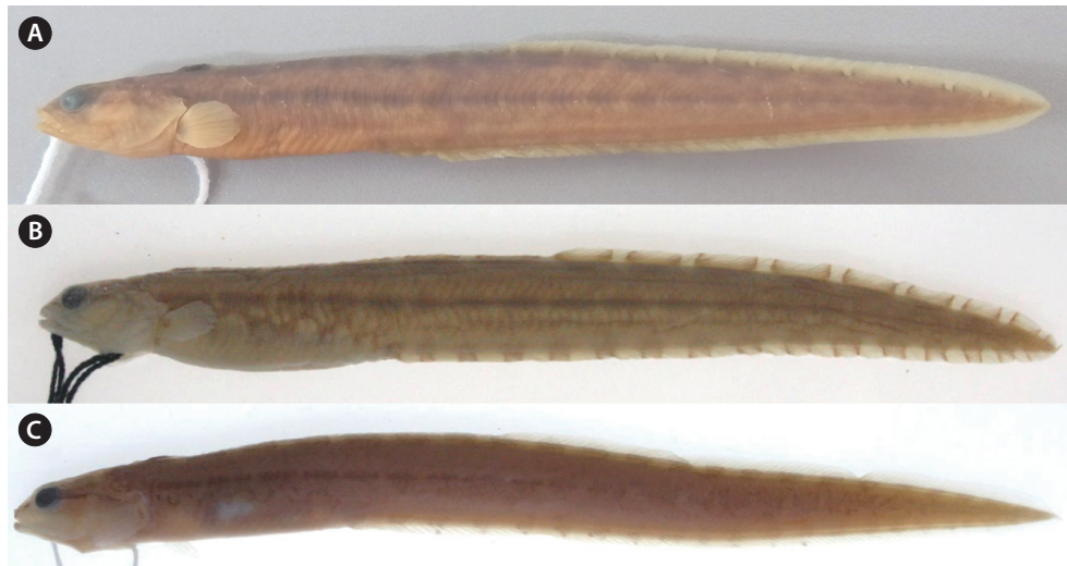
Fig. 1. Photographs of Zoarchias major and Zoarchias glaber . (A) Z. major collected from Korea, NIBR-P0000020408, 91.9 mm TL; (B) Z. major collected from Japan, FRLM 5021, 71.7 mm TL; (C) Z. glaber collected from Japan, FRLM 15388, 78.0 mm TL;